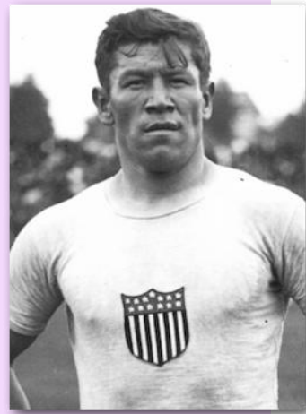
Native American Olympian decathlete, pentathlete and multi-sport professional player Jim Thorpe was born in May, 1887, in Prague, Oklahoma.